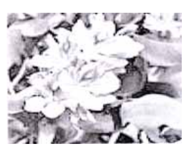
A B 16. What is common to the species shown in figures A and B?